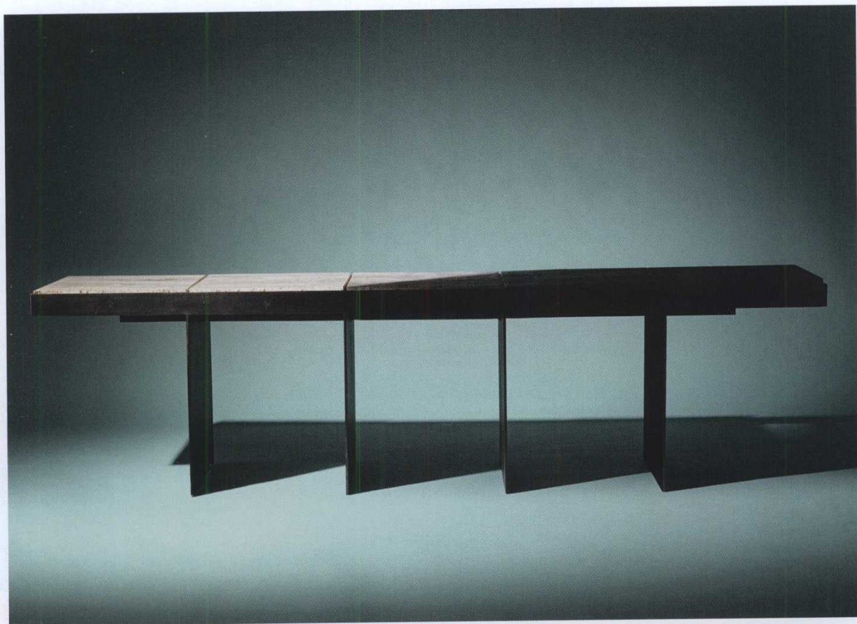
↑ 'FLY-ASH' DESK, BY ANDA BA, PART OF OUR SELECTION OF NEXT-GENERATION DESIGNERS TO WATCH, SEE PAGE 046