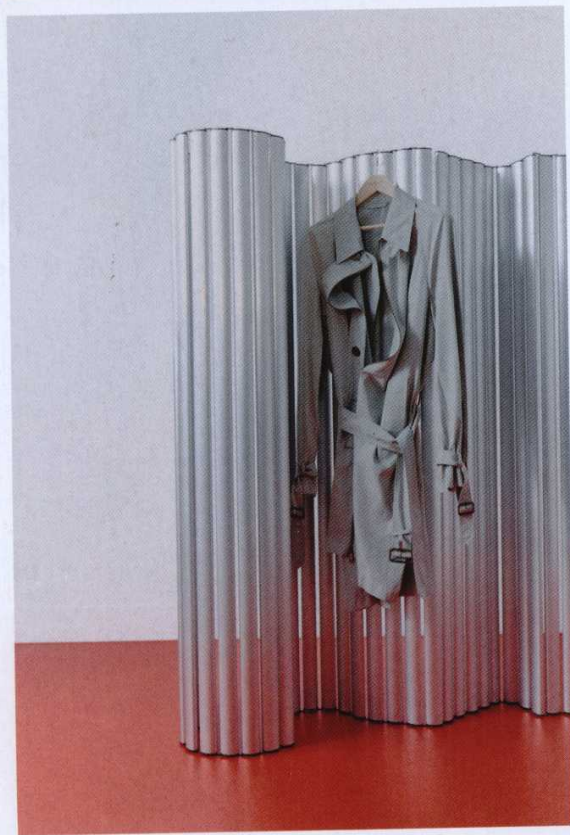
TOP, THE LARCH-CLAD INTERIORS OF A WOODLAND GUESTHOUSE IN UPSTATE NEW YORK. SEE PAGE 180. ABOVE, A TRENCH COAT FROM BURBERRY'S S/S25 COLLECTION, DESIGNED BY DANIEL LEE. SEE PAGE 210